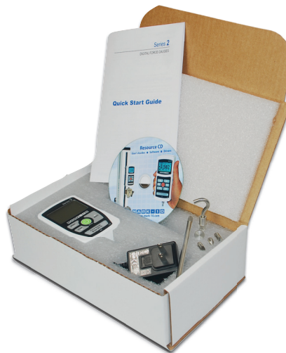
< Shown with the included cushioned shipping carton and optional accessories

The gauges are overload protected to 200% of capacity. An ergonomic, reversible aluminum housing allows for hand held use or fixture mounting, rugged enough for applications in both production and laboratory environments. Series 2 gauges are directly compatible with Mark-10 test stands and grips.