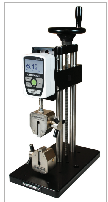
> Shown with an ES20 test stand with G1061 wedge grips