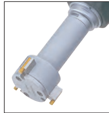
TiN coated contact points (" -10" suffix models only)